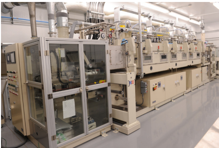
Thin film coating system inside the dry room