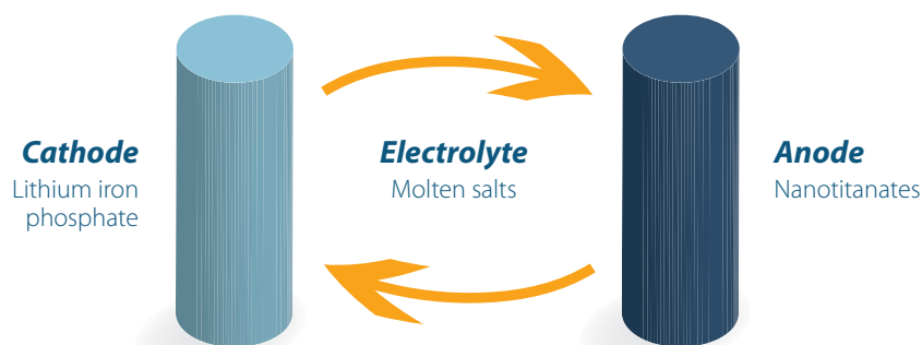
Simplified drawing of a battery with a \text{LiFePO}_4 cathode

Hydro-Québec intends to grant licences to a number of partners to encourage battery manufacturer suppliers to undertake high-quality bulk production of the materials it has developed.