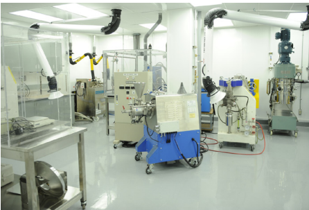
In the nanopowder room, equipment used to create nanometre-sized powders